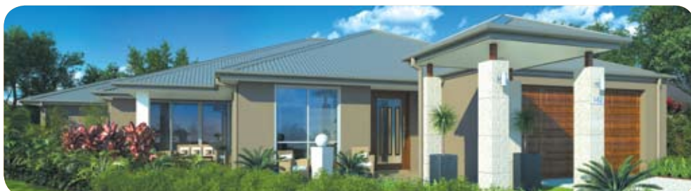
Special - Site 142