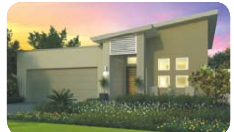
Special - Site 162