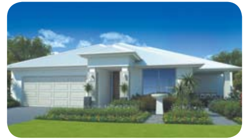
Special - Site 160